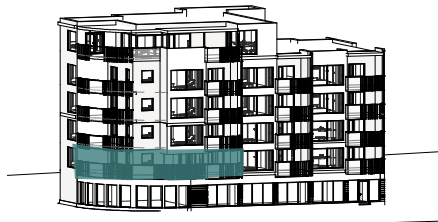
Perspektiv mot syd-vest